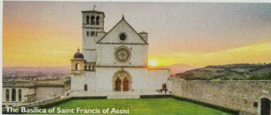
The Basilica of Saint Francis of Assisi