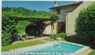
Villa Il Cerro on the outskirts of San Gemini

Tuscany Now & More (020 7684 8884, tuscanynowandmore.com ) offers Il Cerro from £868 for two people for seven days, sharing on a self-catering basis (maximum occupancy of five people). Tuscany Now & More features a range of properties across the region and Italy and can provide private chefs, excursions and other services upon request.