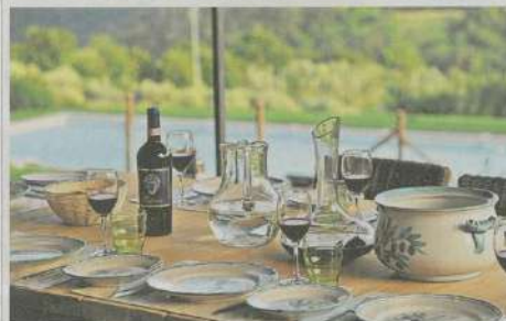
Wine and dine in style: complete The Telegraph Travel Awards 2017 survey for the chance to win a Tuscan house party experience to treasure at the Estate of Petroio

people with restricted mobility. Modern en-suite bathrooms and air-conditioned bedrooms combine with a large open plan living/dining room with a central fireplace and panoramic windows, offering breathtaking views. A professional kitchen and dining area have just been added.